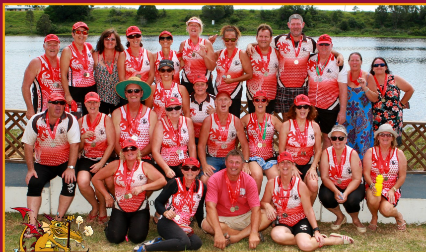
2016 Queensland Dragon Boat Championships