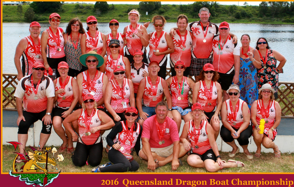
2016 Queensland Dragon Boat Championships

At the end of Sunday's racing, our club made all three grand finals and scored ourselves two silvers - one for Senior A Open and one for Senior B Open . Everyone came away from the State Championships with at least one medal be it bronze or silver.