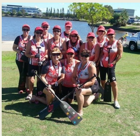
MASTER WOMEN 10's

Unfortunately no medals came the clubs way over the course of the championships.