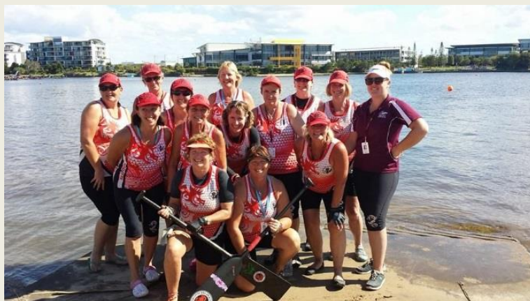
PREMIER WOMEN 10's

However both women's teams spoilt our head coach's plan of going home early every day of competition (much to his delight though), when they made it through to the semi- finals. They were unfortunate not to make it to the last step.