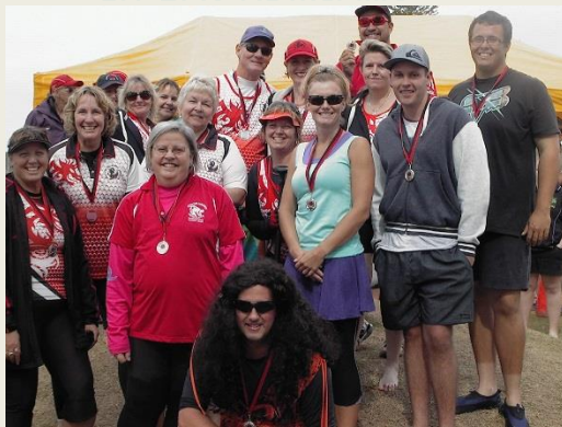
2 nd FIT BOX DRAGONS