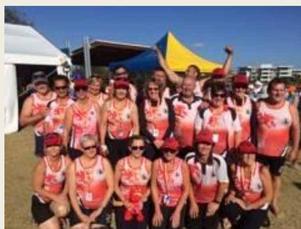
SENIOR A OPEN