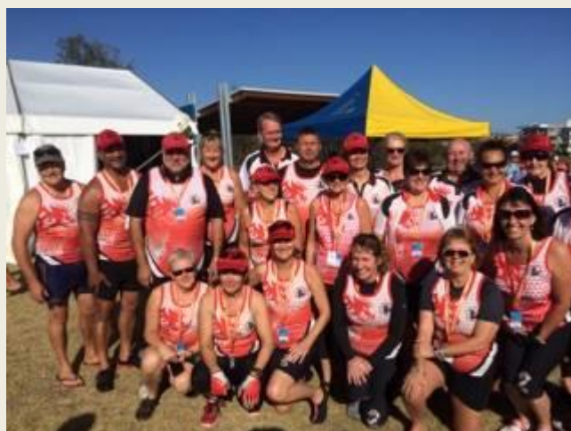
SENIOR B MIXED

We had three teams through to the grand final - Senior A Women 200m and 500m and the Senior B Mixed 500m. Our crews in Senior A Mixed 200m and 500m, Senior B Mixed 200m made the semi- finals.