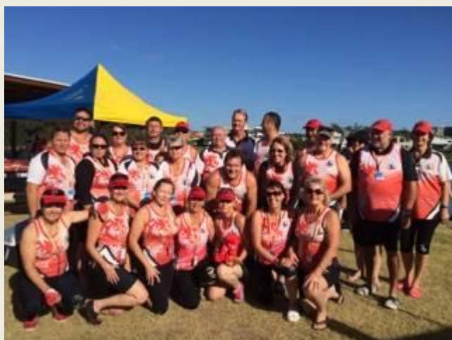
SENIOR A MIXED