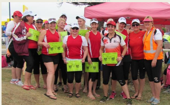
2 nd TOM'S LAW