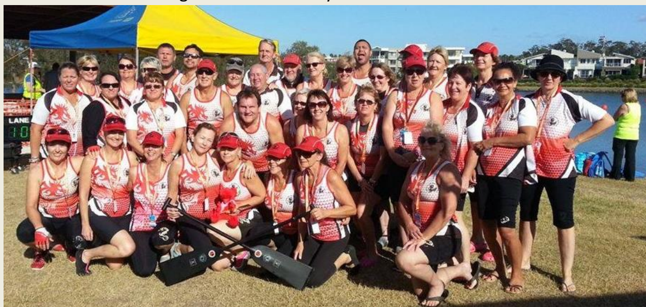
REDCLIFFE RED DRAGONS CREW

In November approximately 25 dragon boat teams took part at the Pan Pac Masters Games being held at the Varsity Lakes Gold Coast.