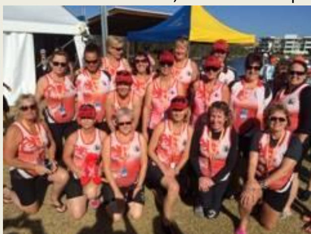
SENIOR A WOMEN

A total of 38 Redcliffe Red Dragons members participated in four teams racing in both 200m and 500m over the two days of racing. These teams were:- SENIOR A 20's Mixed, Women and Opens and SENIOR B 20's Mixed.