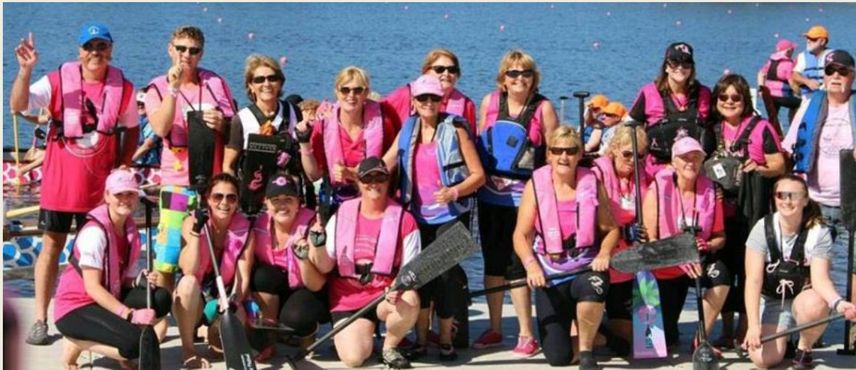
REDCLIFFE PINK SNAPDRAGONS SUPPORTORS TEAM

The Redcliffe Pink Snapdragon Supporters team did the Snapdragons proud winning the Supporters race with a few new paddlers on board.