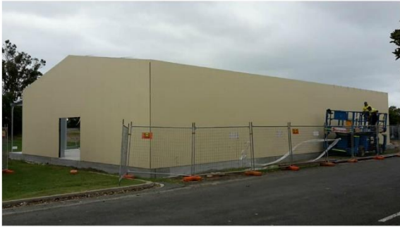
Some of the walls are up