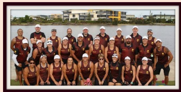
Queensland Senior A