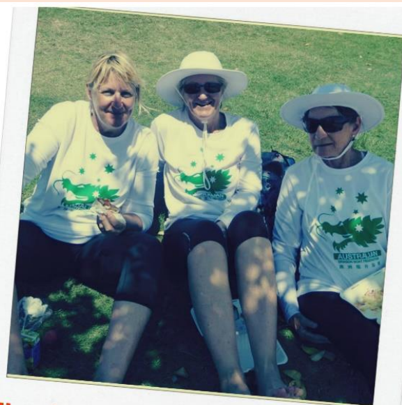
The 3 Amigos from Redcliffe