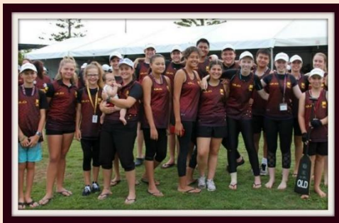
Queensland Under 18's