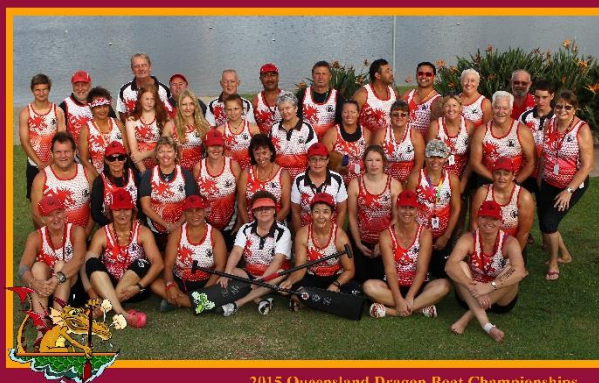
2015 Queensland Dragon Boat Championships