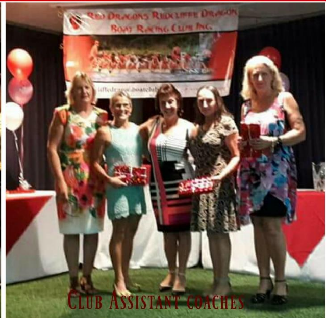
CLUB ASSISTANT COACHES