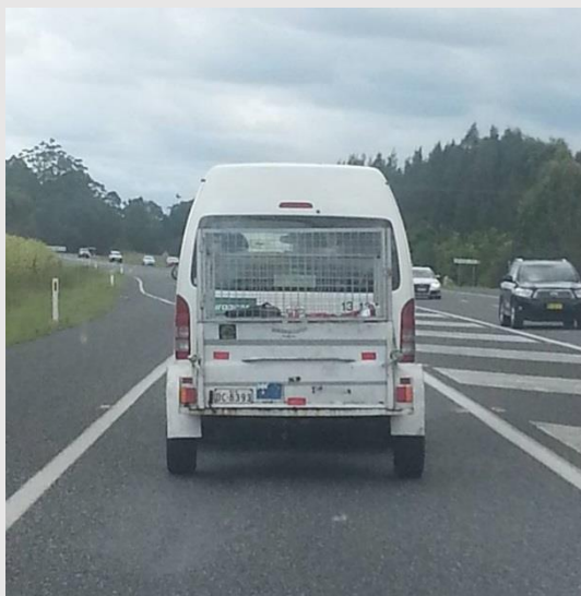
We were being stalked by club member

At the end of October, 19 of the club paddlers travelled to GRAFTON for the Jacaranda Regatta which was held at on the Clarence River. Once again, some of the paddlers took the opportunity to get in some team bonding by travelling the 5 hours to Grafton by bus.