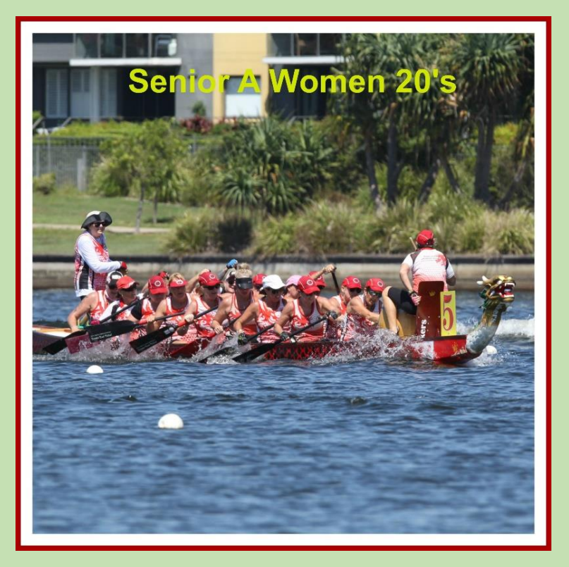
Senior A Open and Women 20's 500m earned 2<sup>rd</sup> and 3<sup>nd</sup> place in their respective finals