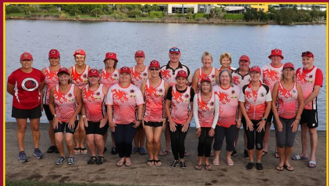
QUEENSLAND DRAGON BOAT CHAMPIONSHIPS 2022

Redcliffe Red Dragons had a small contingent of 21 (4 male and 17 female) paddlers in attendance at the championships entering crews in Senior B Women 10's 500m and 200m and Senior C Mixed 10's 500m, 200m and 1km.